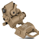
Wilcox™ G24 Mount