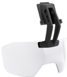
Fixed Arm Visor